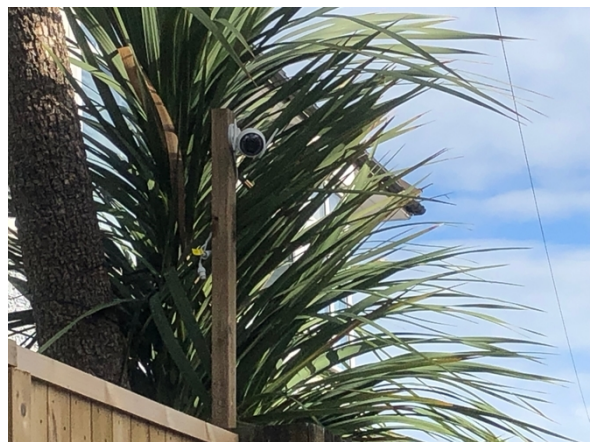
Camera on the property to the right of the club, again directed at the entrance/smoking area.