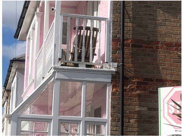
Camera on the neighbouring house, again pointed at the club's entrance/smoking area